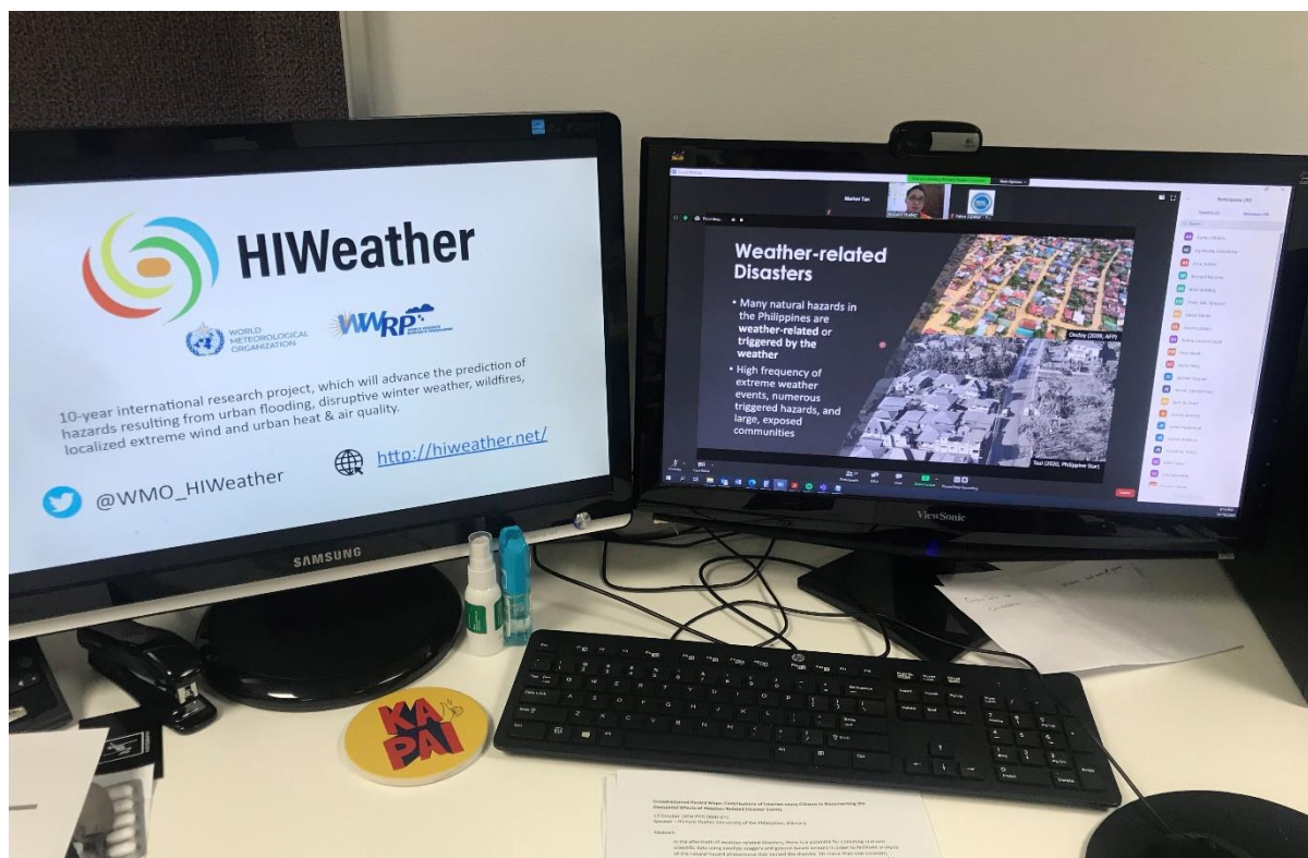
Figure 2. Conducting an online webinar on citizen science

Despite the pandemic's unprecedented challenges, the HIWeather Citizen Science project started developing tools and providing platforms to help individuals and groups share knowledge and build interest and capacities for citizen science. In 2020, the working group started working on the guidance note, producing a journal special issue, and scoping existing citizen science projects. The group also delivered a series of online webinars and workshops on citizen science with a broad range of speakers and attended by participants across continents.